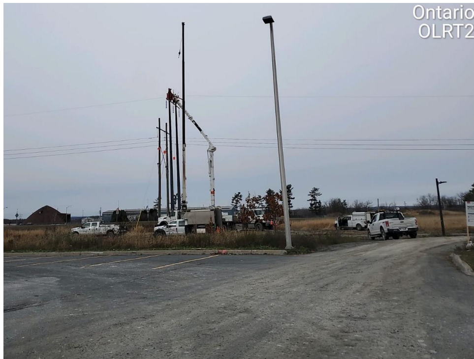
Pictured Above: Hydro One relocates hydro poles at Trim Road.