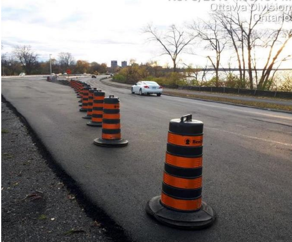
Pictured above: Crews have completed tie-in paving on the SJAM westbound lanes.