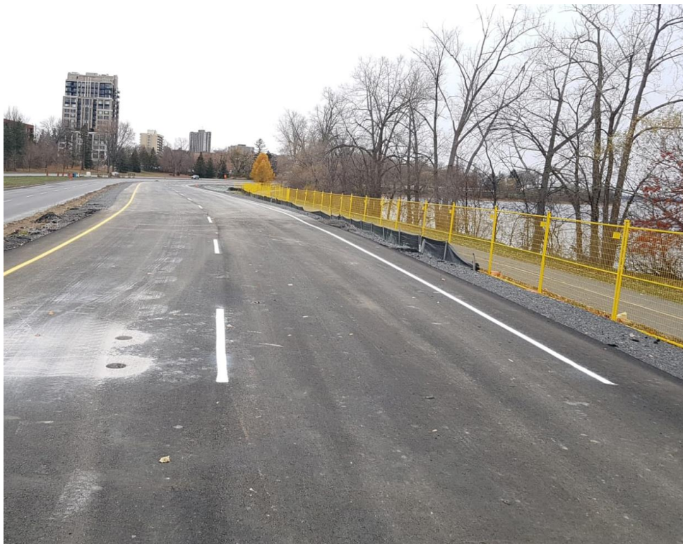
Pictured above: Line painting is underway on the SJAM westbound lanes.