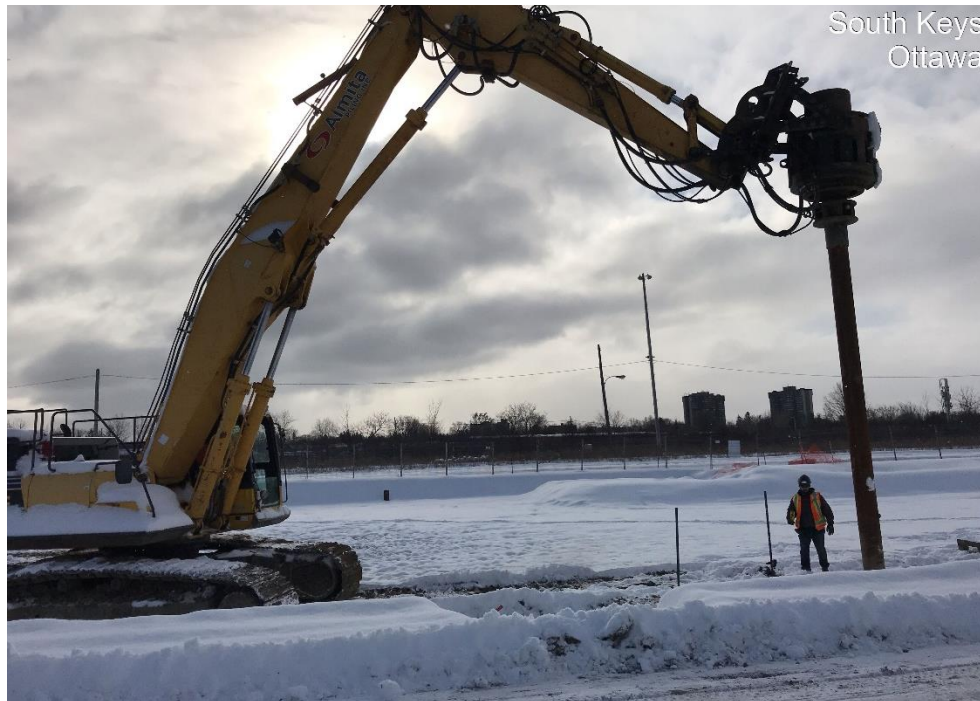
Pictured Above: Helical pile driving is underway at the future Walkley MSF.