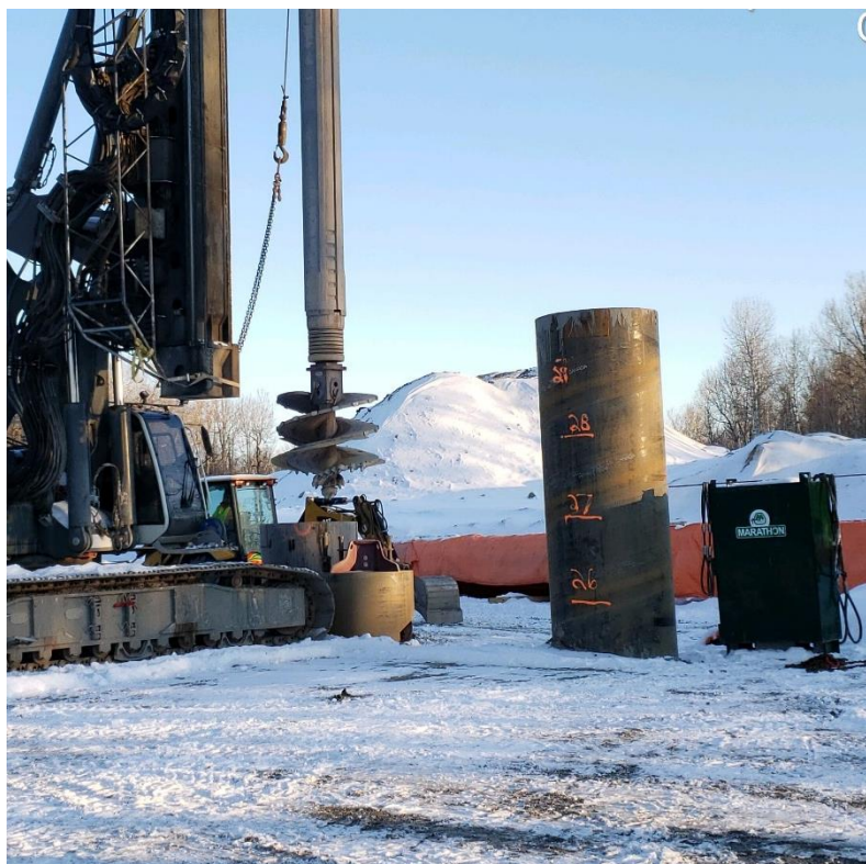
Pictured Above: Caisson drilling on the west side of the Airport Parkway.