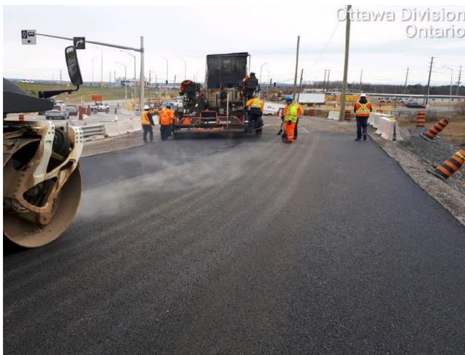
Pictured Above: Crews pave the new OR 174 eastbound offramp at the Montreal Road Interchange.